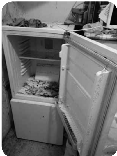
舊雪櫃早已生鏽損壞，不能維修。 The old refrigerator rusted from inside out and could no longer be repaired.

「電器贈長者」計劃的宗旨是協助無依無靠的長者可以老有所居，改善他們基本生活需要，讓他們能維持在社區的生活質素。而善長們慷慨捐出的善款用於購買電器，希望能解決如陳伯伯般年老無依的長者生活上的需要。事實上，今時今日香港仍然有很多長者面對各種生活中不同困境。「電器贈長者計劃」盡心盡力為長者準備他們所需要的家電，善長施善可聯絡：香港灣仔石水渠街85號1樓105室，或致電熱線：2835 4321 或 8107 8324。